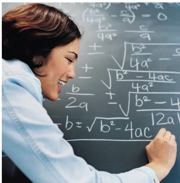
Math class. High-school math prepares students for college science.

Our research examines correlations and does not offer the proof of causation that an experimental study could. However, the lack of significance in cross-disciplinary coursework supports the claim that cross-disciplinary