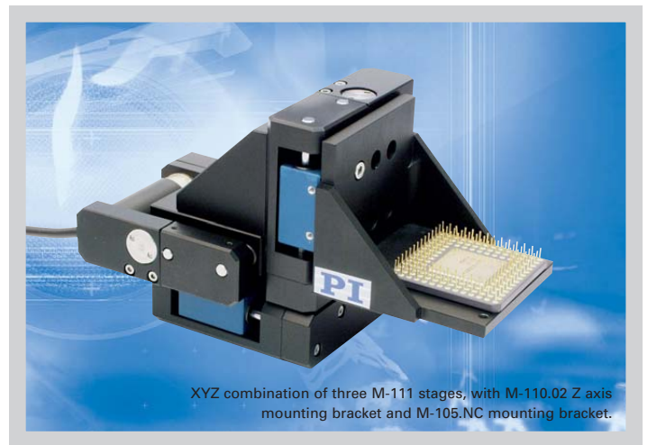
XYZ combination of three M-111 stages, with M-110.02 Z axis mounting bracket and M-105.NC mounting bracket.