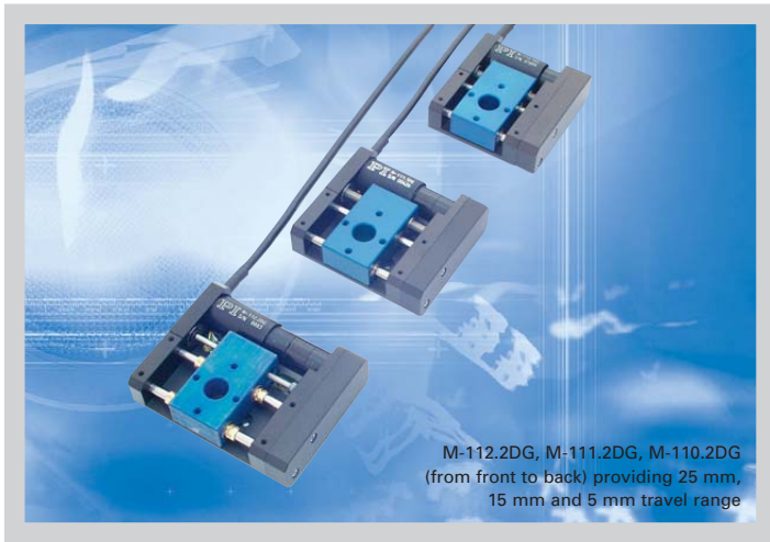
M-112.2DG, M-111.2DG, M-110.2DG (from front to back) providing 25 mm, 15 mm and 5 mm travel range