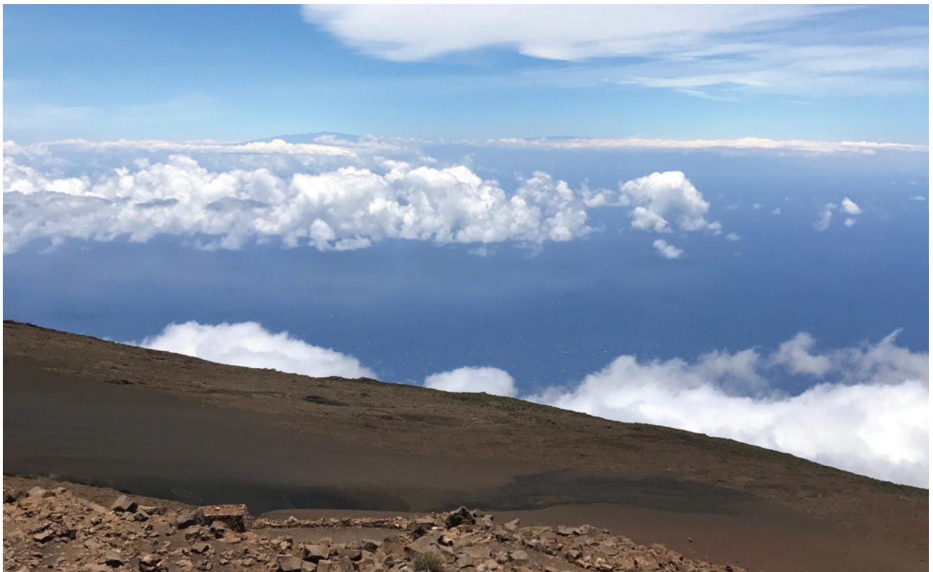
Fig. 5 Ground above the clouds, Haleakala Observatory, Maui, US