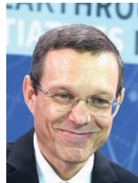
Professor Abraham Loeb

The recent discovery 1 of a habitable Earth-mass planet four light years away and orbiting our nearest star, Proxima Centauri, revealed a new opportunity in the search for life. Due to the proximity of this planet, Proxima b, it is easiest to use it as a first target, either for remote sensing of the faint radiation signals from biologically produced molecules such as oxygen, or for sending spacecraft that will photograph the planet's surface from a close distance. The Breakthrough Starshot initiative, whose advisory committee I chair, 2 aims to launch a lightweight spacecraft to a fifth of the speed of light using a laser beam pushing on a sail (Fig. 2), 3-6 so that the camera attached to the sail could reach nearby habitable planets like Proxima b within our lifetimes. The pursuit of this concept became feasible owing to recent advances in laser technology and the miniaturisation of electronics. Starshot will soon begin a five-year phase of technology demonstration at a funding level of $100m (~€86m), provided by the entrepreneur and physicist Yuri Milner through the Breakthrough Prize Foundation. By taking photographs during a flyby of Proxima b, we would like to find out whether the planet's surface