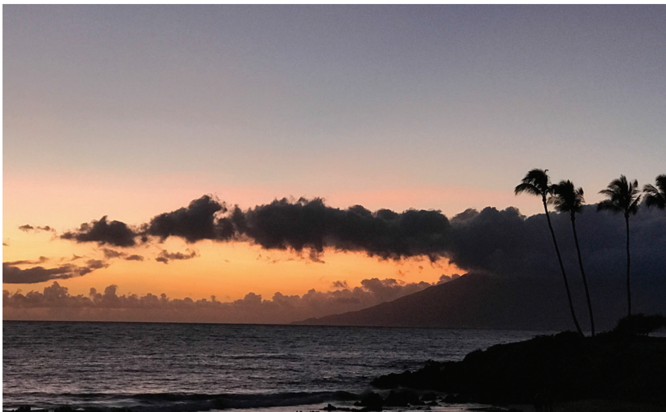
Fig. 4 Sunset, Maui, US

warning sign can be found just next door: Mars has a tenth of the Earth's mass and has lost its atmosphere. Does Proxima b have an atmosphere?