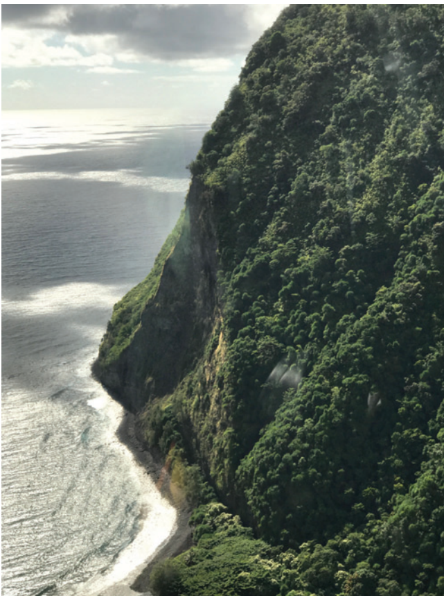
Fig. 3 Oceanic glint, Hawaii, US

The evidence for an alien civilisation might not be in the traditional form of radio communication signals. Rather, it could involve detecting artefacts on planets through the spectral edge from solar cells, 9 industrial pollution of atmospheres, 10 artificial lights 11 or bursts of radiation from artificial beams sweeping across the sky. 12 The latter type of signal is to be expected if another civilisation has mastered by now the technology of lightsails that we hope to develop with Starshot. 8,12 Finding the answer to the question 'are we alone?' will change our perspective on our place in the Universe