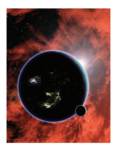
Figure 1: Artistic rendition of extensive city lights on the night side of an exoplanet, signaling the presence of an advanced technological civilization.

an artificially f_{\oplus} -illuminated object would be brighter by a factor \sim 3.6 \times 10^2 than if it were sunlight-illuminated. This implies that an f_{\oplus} -illuminated surface would provide the same observed flux F as a sunlight-illuminated object at that distance, if it is \sim \sqrt{3.6 \times 10^2} = 19 times smaller in size. In other words, an f_{\oplus} -illuminated surface of size 53 km (comparable to the scale of a major city) would appear as bright as a 10^3 km object which reflects sunlight with A = 7%. Since \sim 10^3 km objects were already found at distances beyond \sim 50 AU, we conclude that existing telescopes and surveys could detect the artificial light from a reasonably brightly illuminated region, roughly the size of a terrestrial city, located on a KBO.